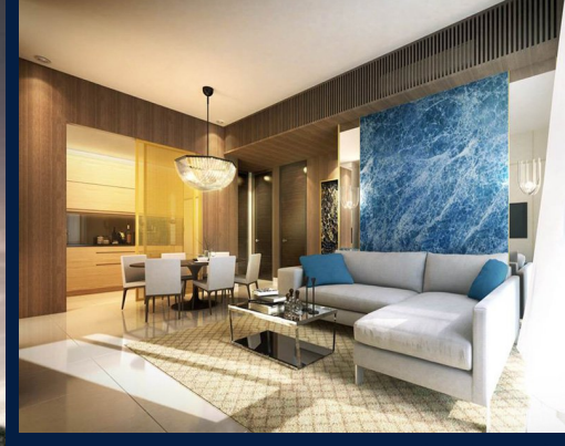
3 - Bedroom Unit