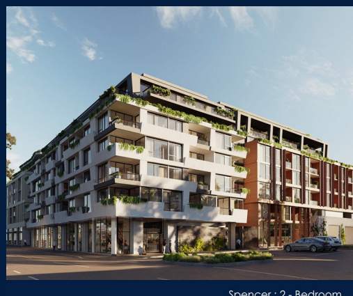
Spencer: 2 - Bedroom