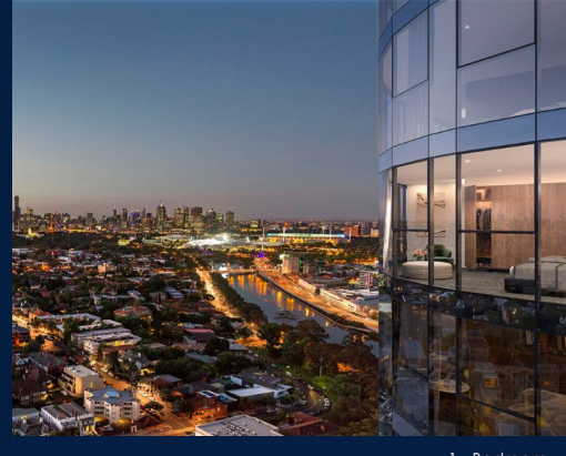
1 - Bedroor