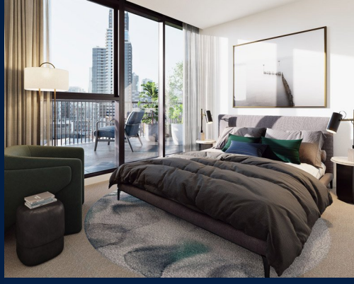
Roden: 3 - Bedroom