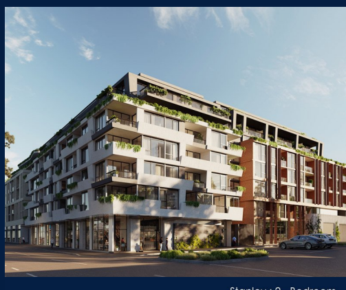
Stanley: 2 - Bedroom