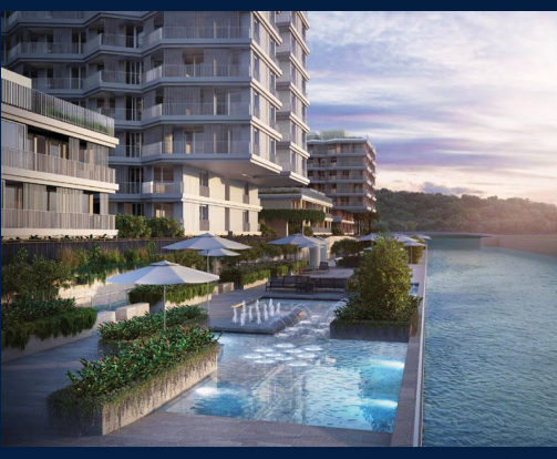
3 - Bedroom Premium