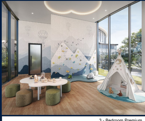
3 - Bedroom Premium